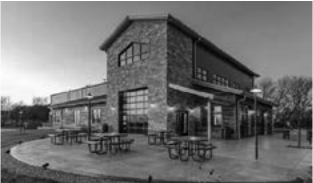
Dancing Goat Distillery • Cambridge, WI • 16,192 sq.ft.

You're the best at your craft and we're the best at ours!