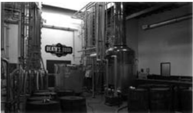
Death's Door Distillery • Middleton, WI • 24,000 sq.ft.