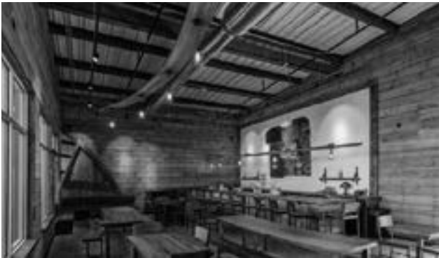
Stateline Distillery • Madison, WI • 6,500 sq.ft.